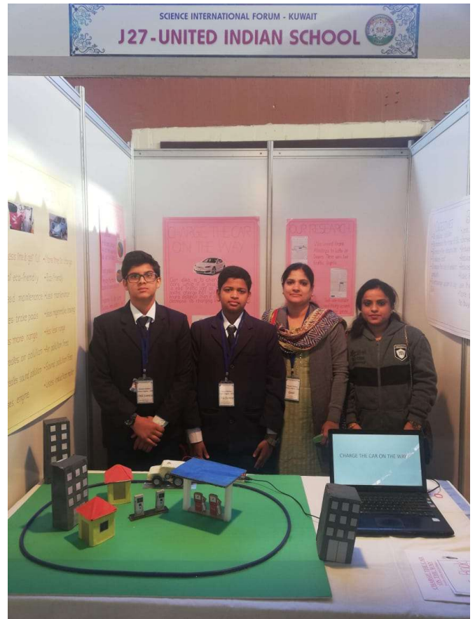
Science International Forum-Kuwait