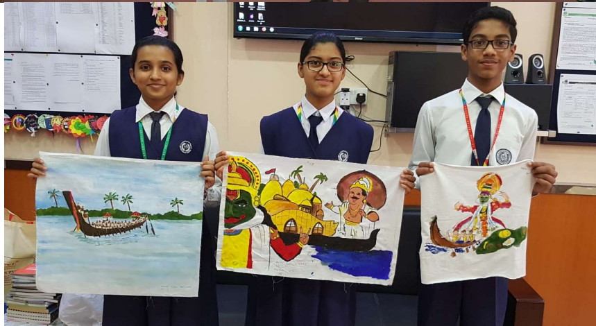
Interhouse Fabric Painting Competition – Class VIII