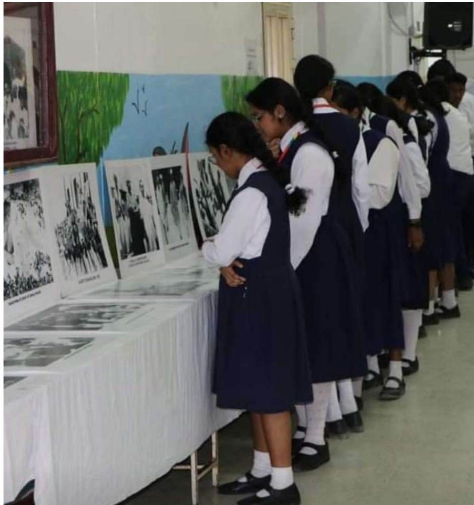
Gandhi Jayanti –Photo Exhibition