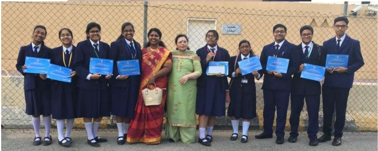
Hindi Divas Celebration