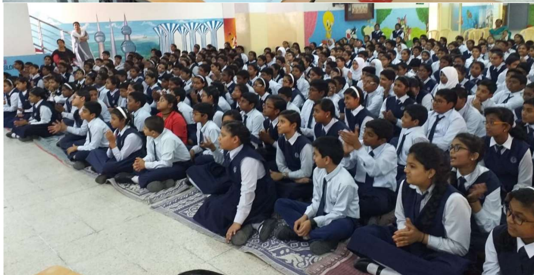
Inter house Quiz Competition – Class VIII