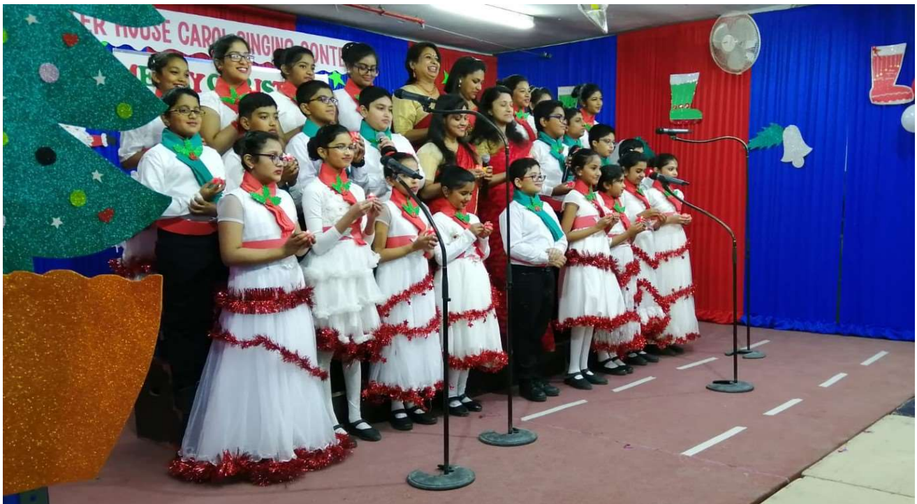
Christmas Carol Singing Competition