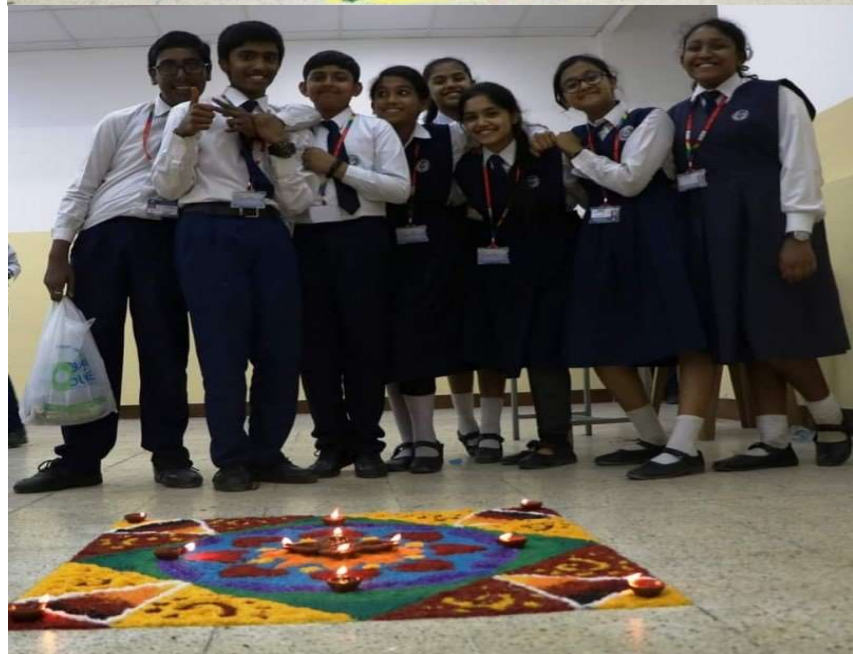
Interhouse Rangoli Competition – Class VIII