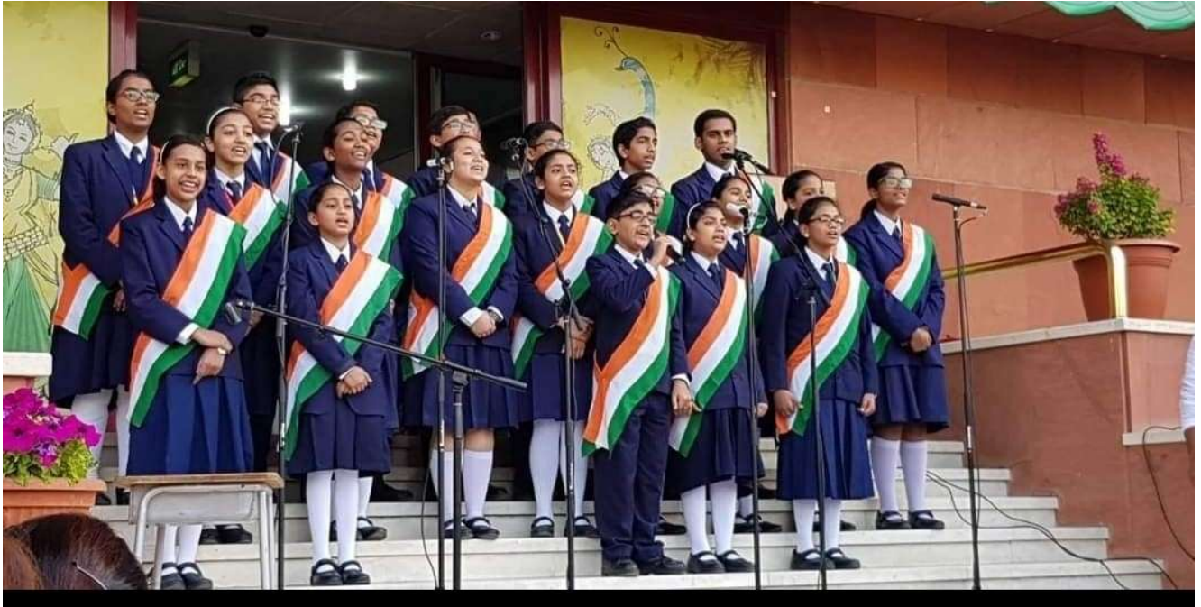
Republic Day Celebration at Indian Embassy